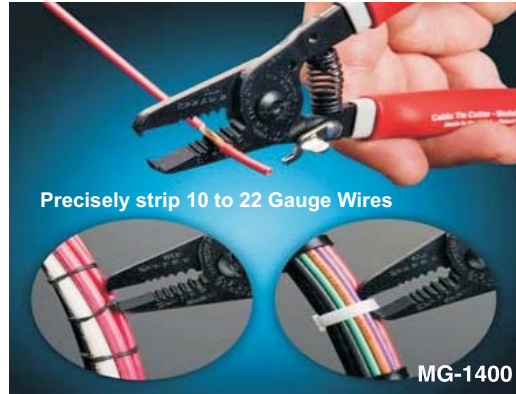
MG-1400 Patent # 8,365,418