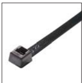
Standard Cable Ties