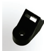
Heavy Duty Impact Resistant Screw Mounts

ACT ADVANCED CABLE TIES, INC. 245 Suffolk Lane, Gardner, MA 01440 Phone: 800.861.7228 - Fax: 978.630.3999 sales@actfs.com